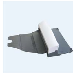
FB-70M MICR BASE